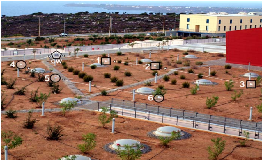
iCubes v0.2: Low-power and low-cost, programmable transceiver node and sensor network, designed and built at Telecom Lab, for teaching and research purposes.